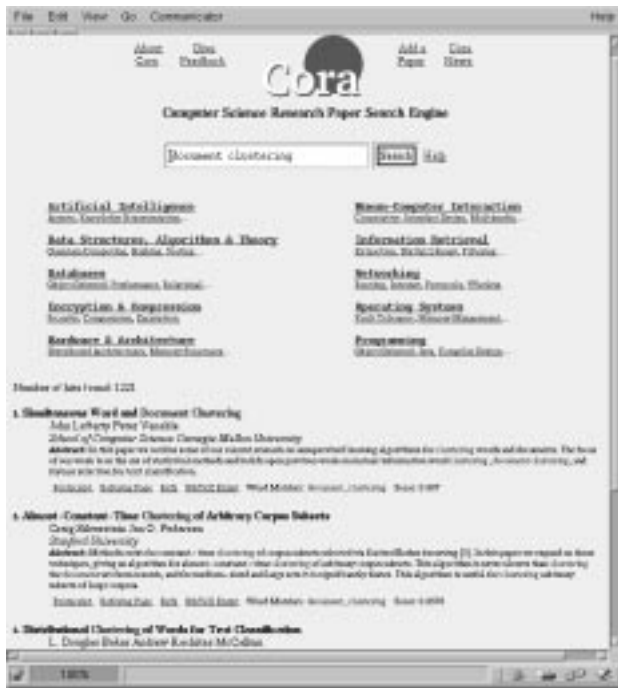
Figure 1: A screen shot of the query results page of the Cora search engine. Note the topic hierarchy and the extracted paper titles, authors and abstracts.

and further processed if they are determined to be research papers ( e.g. by having Abstract and Reference sections). Important identifying information such as the title and author is then extracted from the head of each paper, as well as the bibliography section. The extracted results are used to group citations to the same paper together and to build a citation graph. Phrase and keyword search facilities over the collected papers are provided, as well as a computer science topic hierarchy which lists the most-cited papers in each research topic. Figure 1 shows the results of a search query as well as the topic hierarchy. Our hope is that, in addition to providing a platform for machine learning research, this search engine will become a valuable tool for other computer scientists. The following sections describe the new research that makes Cora possible; more detail is provided in McCallum et al. [1999] and by other papers available at Cora’s web page.